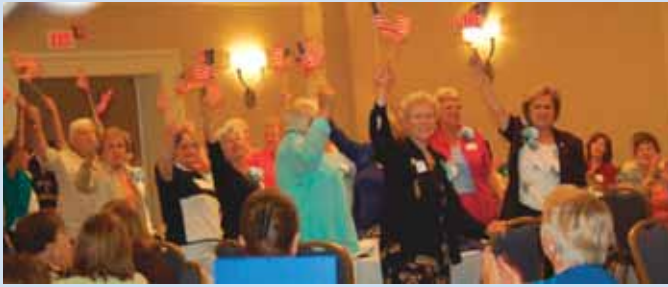
Class of 1958 celebrate their 50-year anniversary