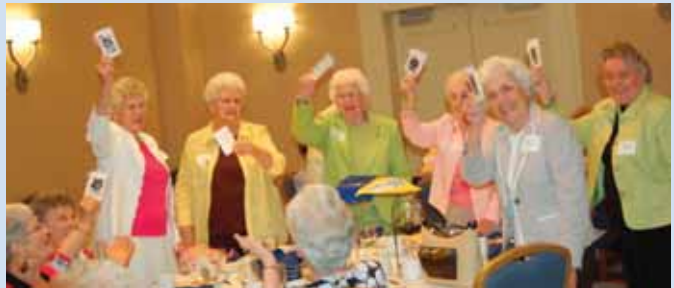
The class of 1948 celebrating their 60-year anniversary