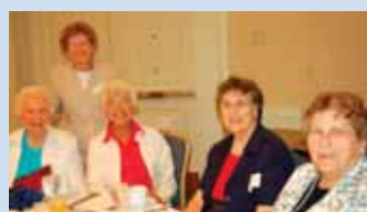
Class of 1952 celebrate 56 years since graduating from HHSN