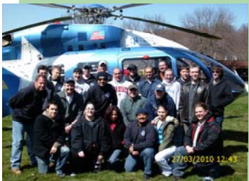
Interact with other Emergency Service Providers

The primary focus of the Emergency Medical Technician is to provide basic emergency medical care and transportation for critical and emergent patients who access the emergency medical system. This individual possesses the basic knowledge and skills necessary to provide patient care and transportation. Emergency Medical Technicians function as part of a comprehensive EMS response, under medical oversight. Emergency Medical Technicians perform interventions with the basic equipment typically found on an ambulance. The Emergency Medical Technician is a link from the scene to the emergency health care system